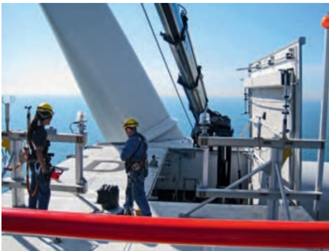
In action on an offshore system

The restoration of a wind turbine becomes even more complex if our experts not only have to “hang around”, but also have to work above water – such as on an offshore wind turbine in the North Sea. A technical fault had caused gear oil to leak and had damaged some of the nacelles as well as a number of the system's external parts. BELFOR was commissioned with cleaning the inside and outside of the tower to prevent oil leaking into the North Sea. Thanks to our maritime expertise and flawless collaboration with the customer, the entire system was fully restored in just three days – with not a single unnecessary drop of oil spilt.