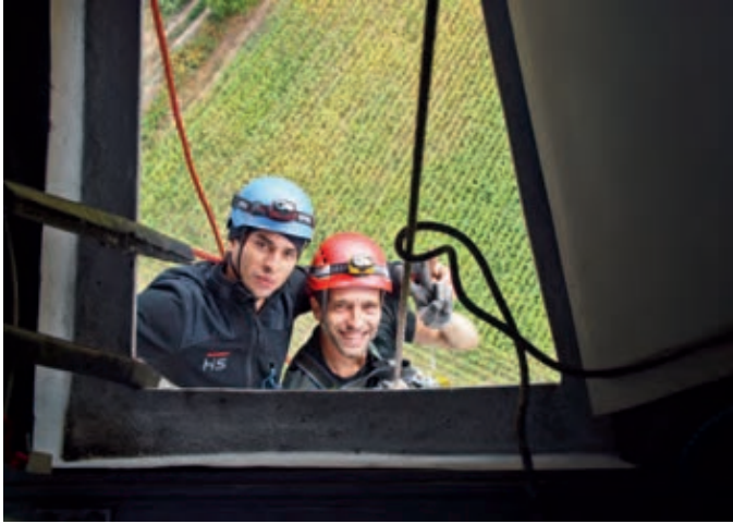
A head for heights is essential: climbers in action

The severely contaminated nacelles were then partially dismantled, loaded onto transporters and taken to Germany, to BELFOR DeHaDe's main repair factory in Hamm (Westphalia). With specialist equipment and machinery restoration expertise at the factory, the nacelles were thoroughly cleaned and returned to the manufacturer.