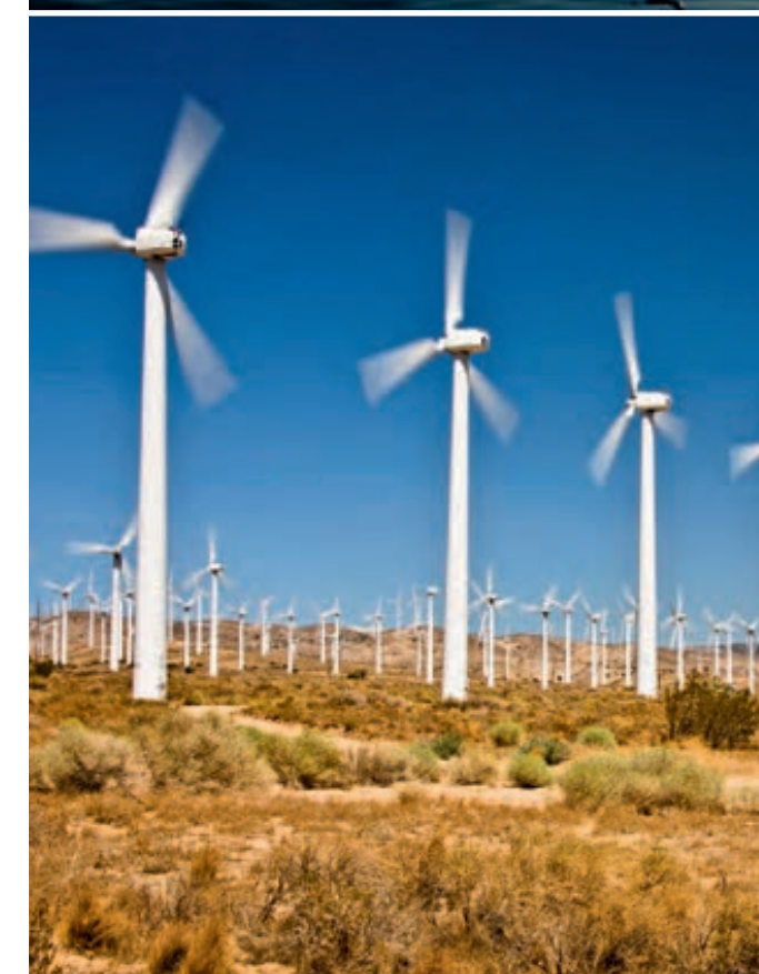
Users of fossil fuels are facing strong headwinds – onshore and offshore